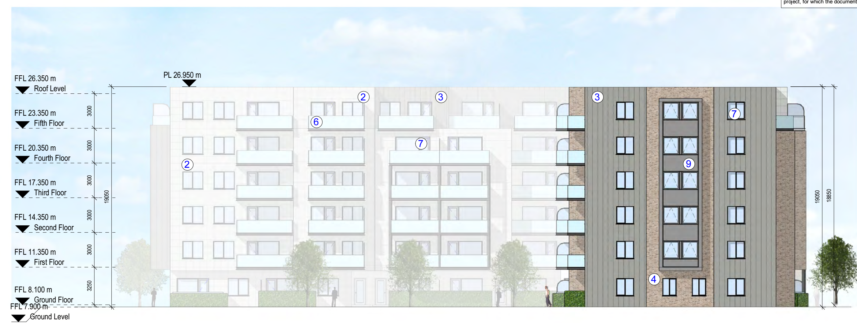
BLOCK A - SOUTH ELEVATION Scale 1 : 200