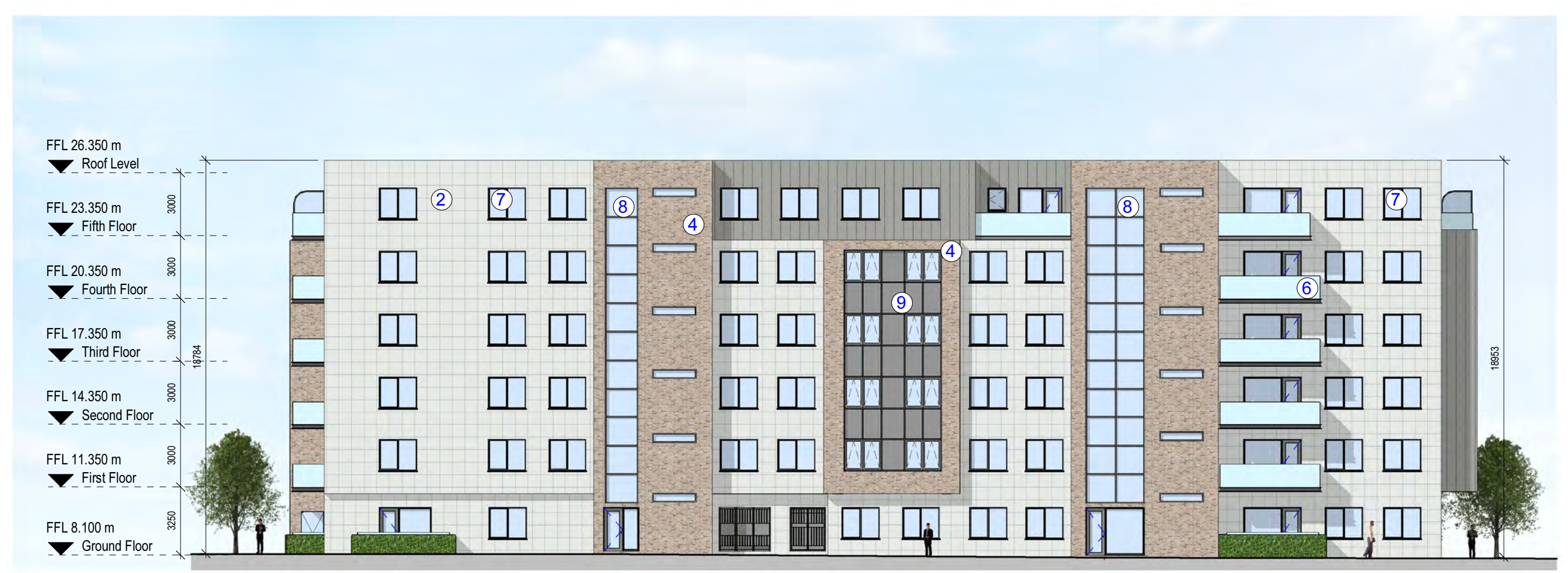
BLOCK A - NORTH ELEVATION Scale 1 : 200