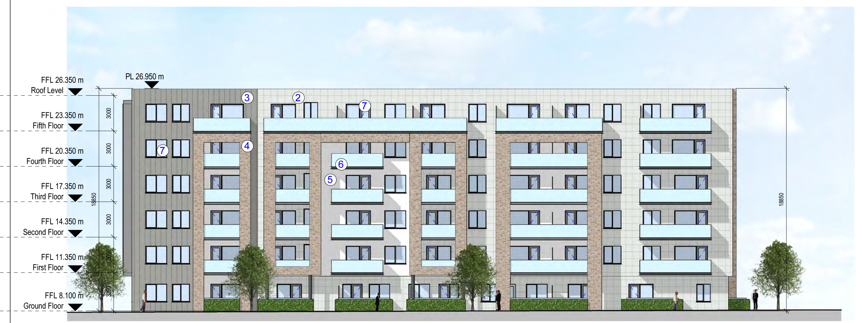
BLOCK A - EAST ELEVATION Scale 1 : 200