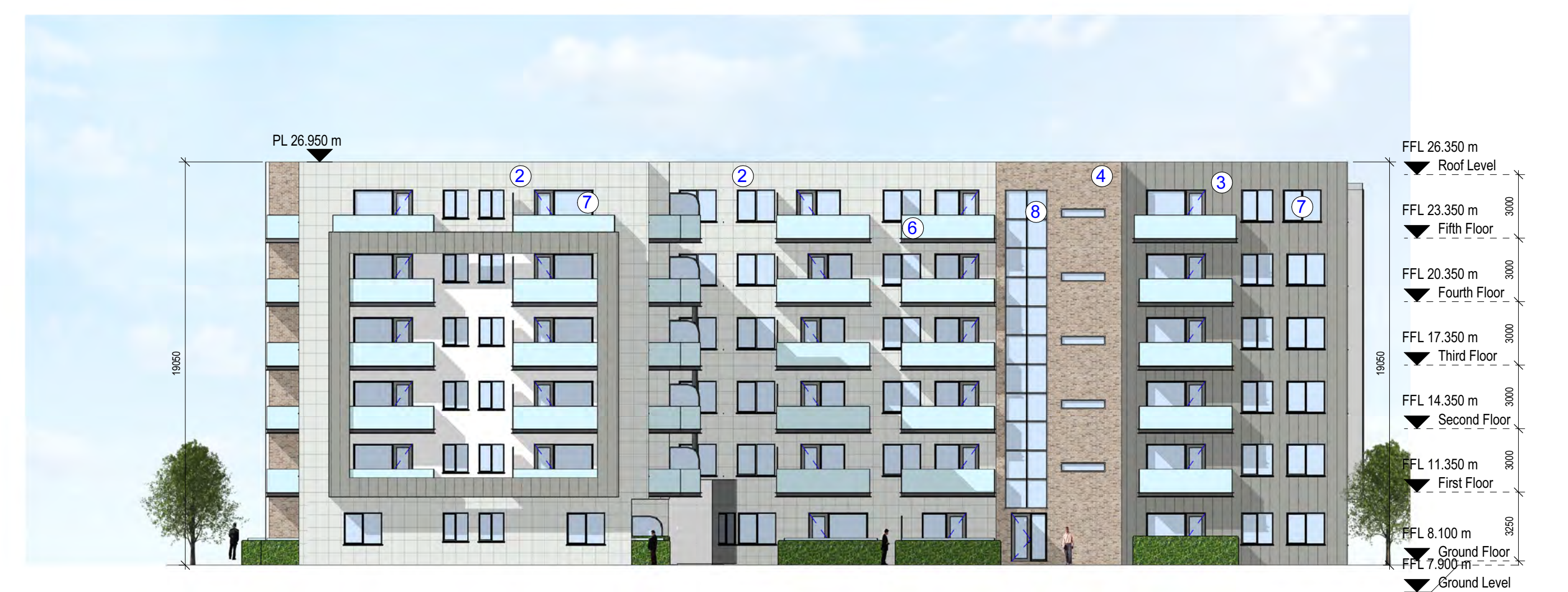
BLOCK A - WEST ELEVATION Scale 1 : 200